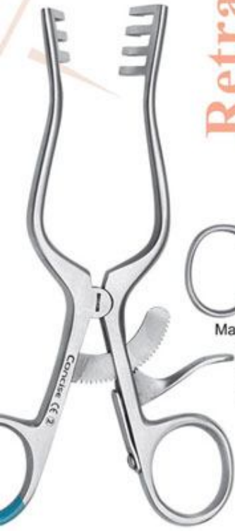
Weitlaner Retractors SU-17-05786-13 13 cm SU-17-05786-14 14 cm