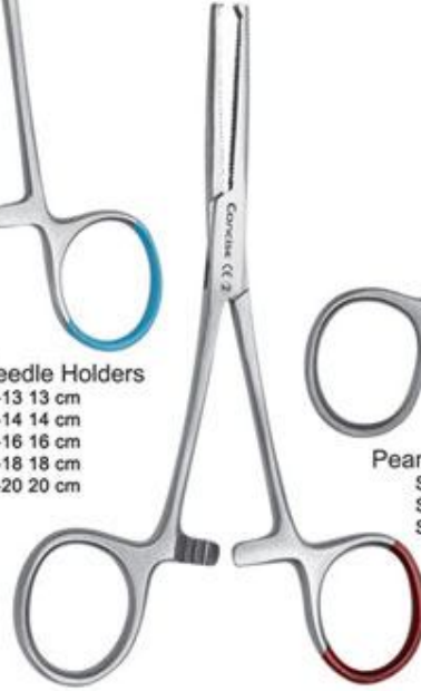
Kocher Artery Forceps SU-16-04394-14 14 cm SU-16-04394-16 16 cm SU-16-04394-18 18 cm