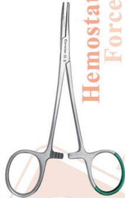
Halsted Mosquito Artery Forceps SU-16-04294-12 Str 12 cm SU-16-04295-12 Cvd 12 cm