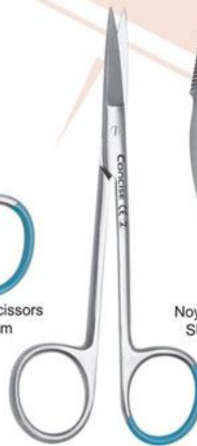
Iris Scissors SU-14-02462-12 12.5 cm