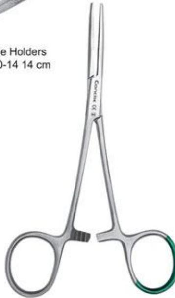
Pean Hemostatic Forceps SU-16-04382-13 13 cm SU-16-04382-14 14 cm SU-16-04382-16 16 cm