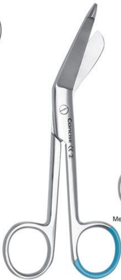
Lister Bandage Scissors SU-14-02629-14 14 cm SU-14-02629-15 15 cm SU-14-02629-18 18 cm