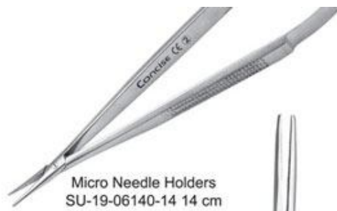
Micro Needle Holders SU-19-06140-14 14 cm