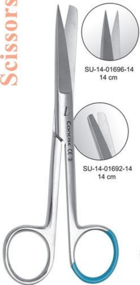
SU-14-01696-14 14 cm