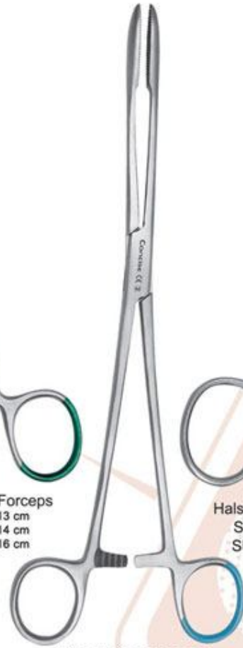
Gross Maier Forceps SU-16-04900-20 20 cm SU-16-04900-25 25 cm