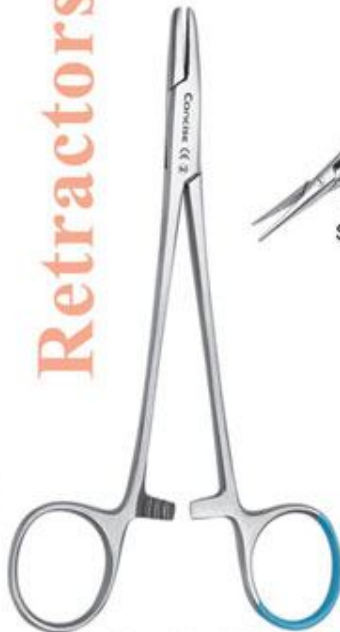
Mayo Hegar Needle Holders SU-19-06342-13 13 cm SU-19-06342-14 14 cm SU-19-06342-16 16 cm SU-19-06342-18 18 cm SU-19-06342-20 20 cm