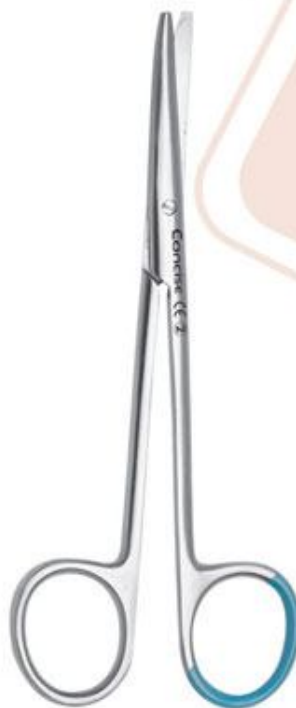
Metzenbaum Dissecting Scissors SU-14-01802-14 14 cm